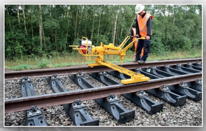
KLP<sup>®</sup> Hybrid Polymer Track Sleepers, Zwolle (The Netherlands).