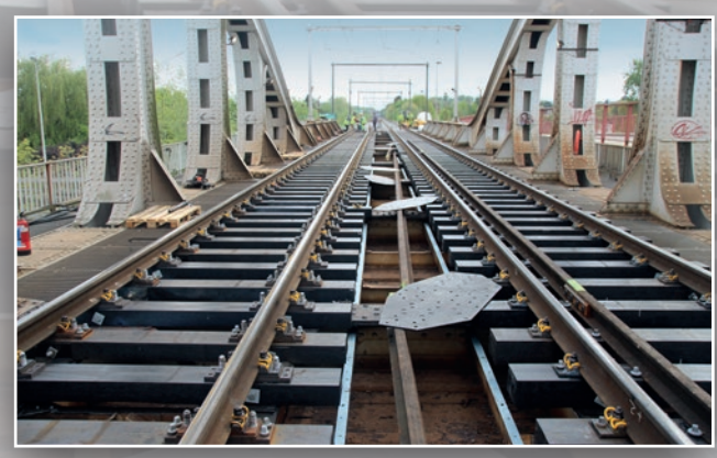
KLP<sup>®</sup> Hybrid Polymer Bridge Sleepers, Gent (Belgium).