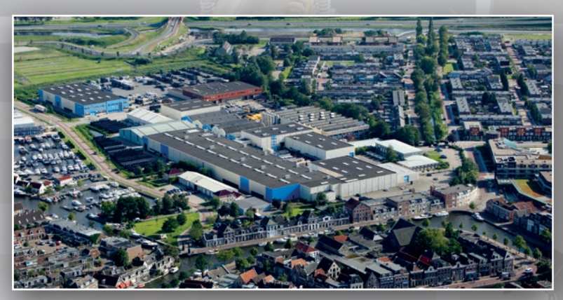
Production facilities in Sneek, The Netherlands.