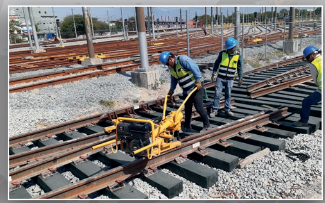
KLP® Hybrid Polymer Switch & Crossing Sleepers, Monterrey (Mexico).